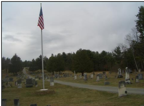
New Flagpole in the Lewis Cemetery