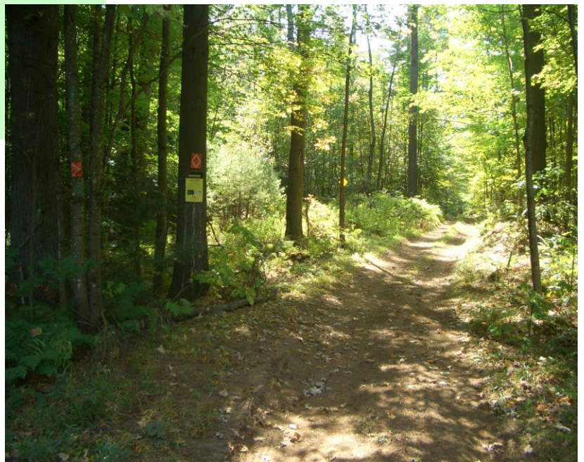
Trail to Thrall Lake from the North Entrance