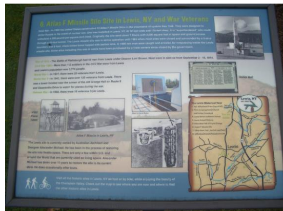
Interpretative sign next to Veterans Park

The interpretative sign above was to be located on Hale Hill for the Missile Site. Some of the signs were moved. Go exploring and see if you can find where they are now located.